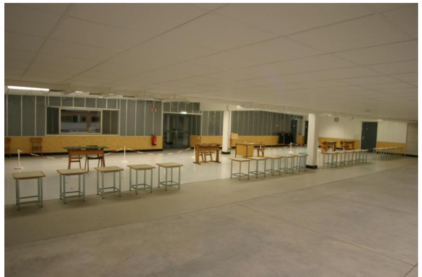
Positions and Backside Area