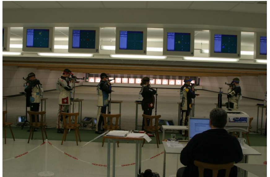
The Positions 50m