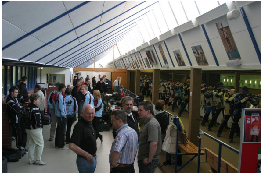
Overview 10m range and Backside Area