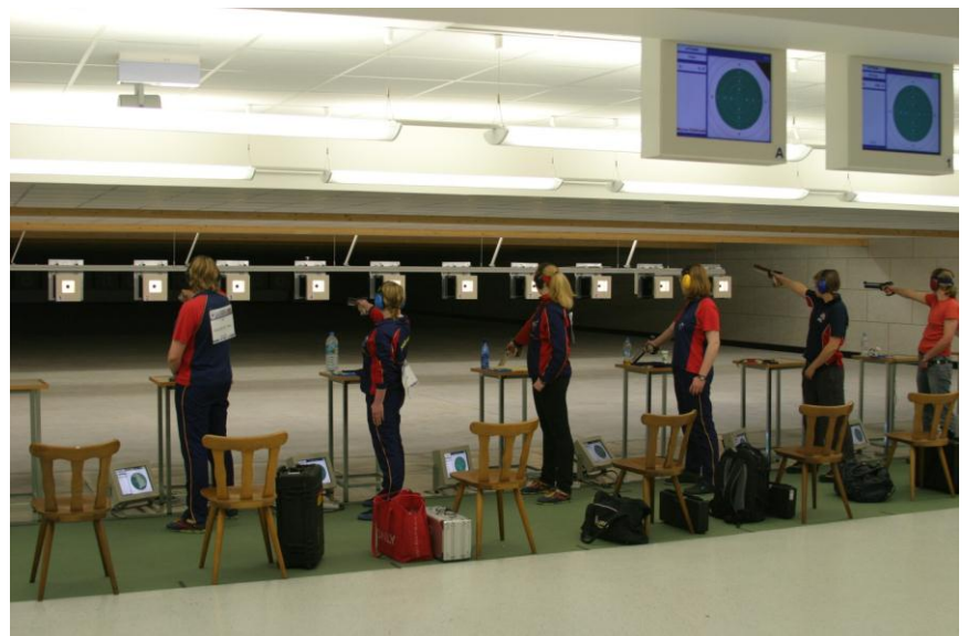
The Positions 10m