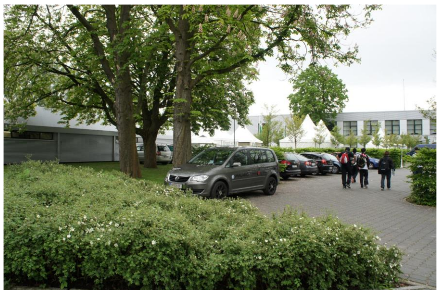
Outside view Shootingrange and parking area