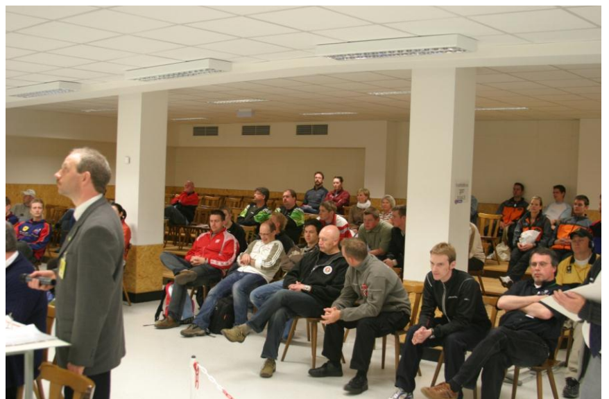
Positions and Backside Area