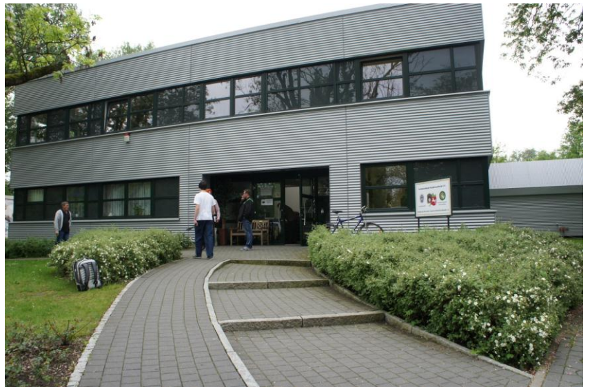
Main Office Building

For all food options which you need from 5 up to 500 Persons